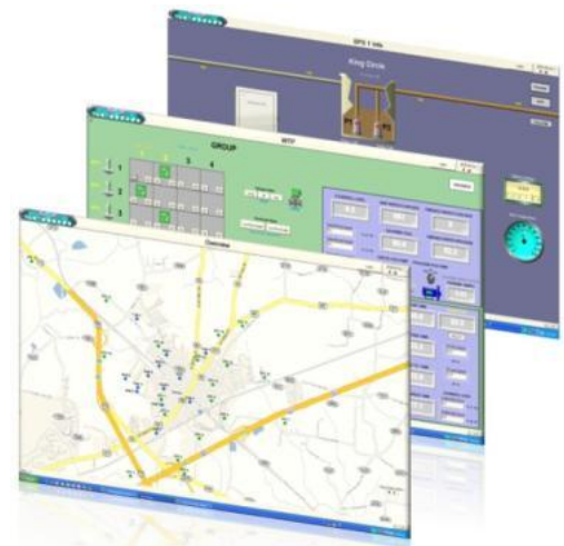
Custom Display Screens created by CCU Inc. using VTScada

The town was so pleased with the progress of the installation that they decided to tie-in the remaining seven wells to the SCADA system. These wells had direct lines to the water plant so staff could turn the pumps on and off